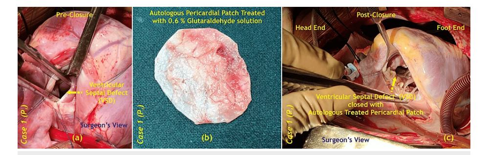
FIGURE 1: Intraoperative VSD closure with an autologous pericardial patch of case one (P1); (a) pre-closure, (b) patch preparation, (c) post-closure

Precise patch design: An autologous pericardial patch, meticulously sized and treated with glutaraldehyde to enhance durability and minimize immune response, was prepared for closure of the VSD (Figure 1).